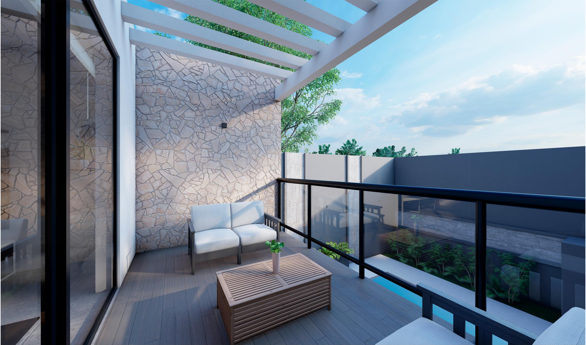
BALCONY / BALCON