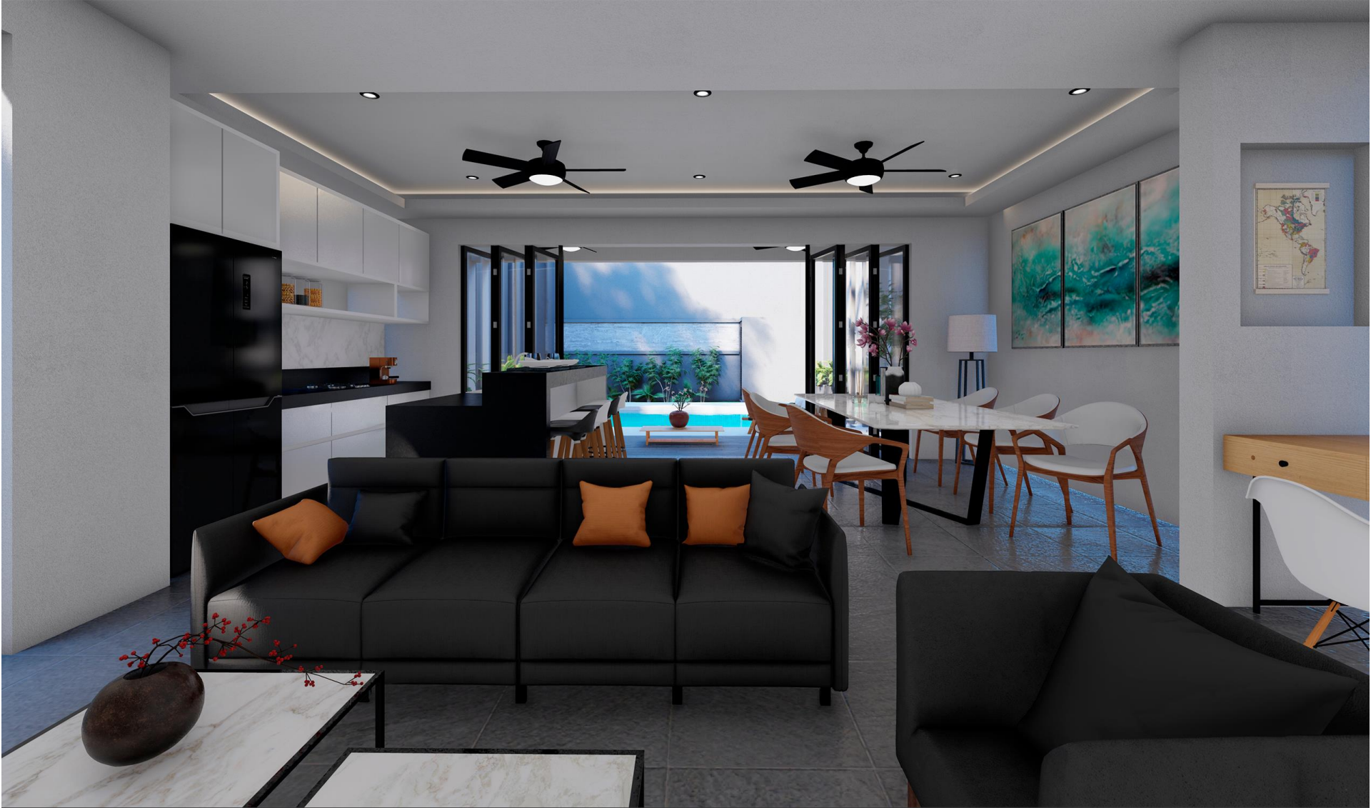
LIVING ROOM / SALA DE ESTAR