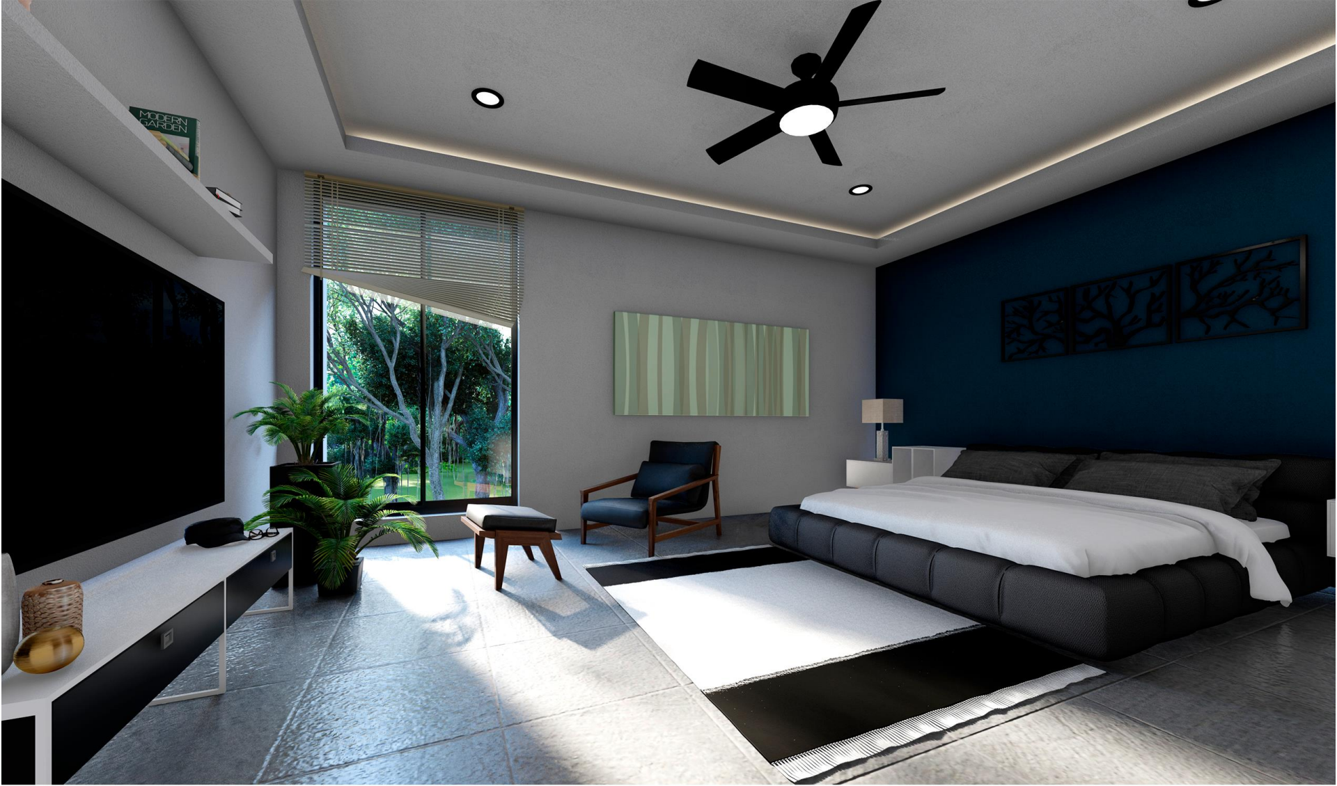
MASTER BEDROOM / RECAMARA PRINCIPAL