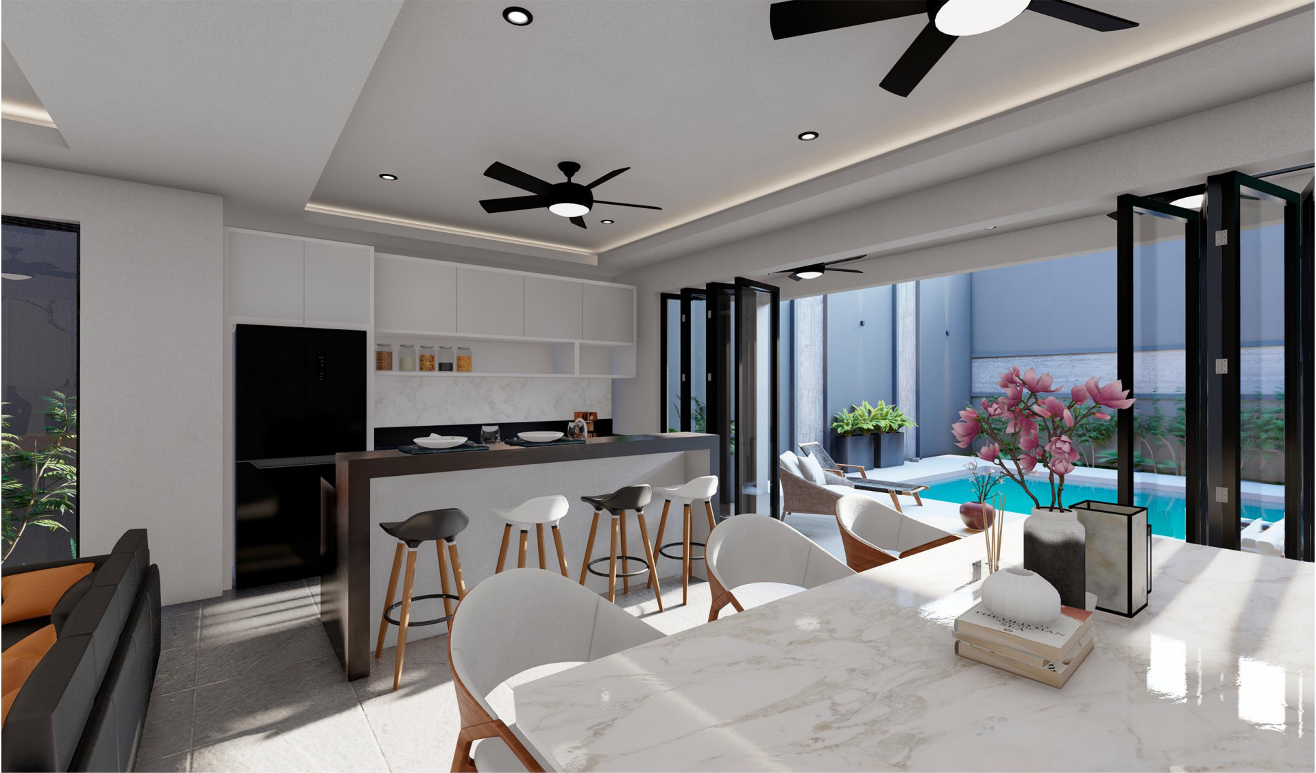
LIVING ROOM / SALA DE ESTAR