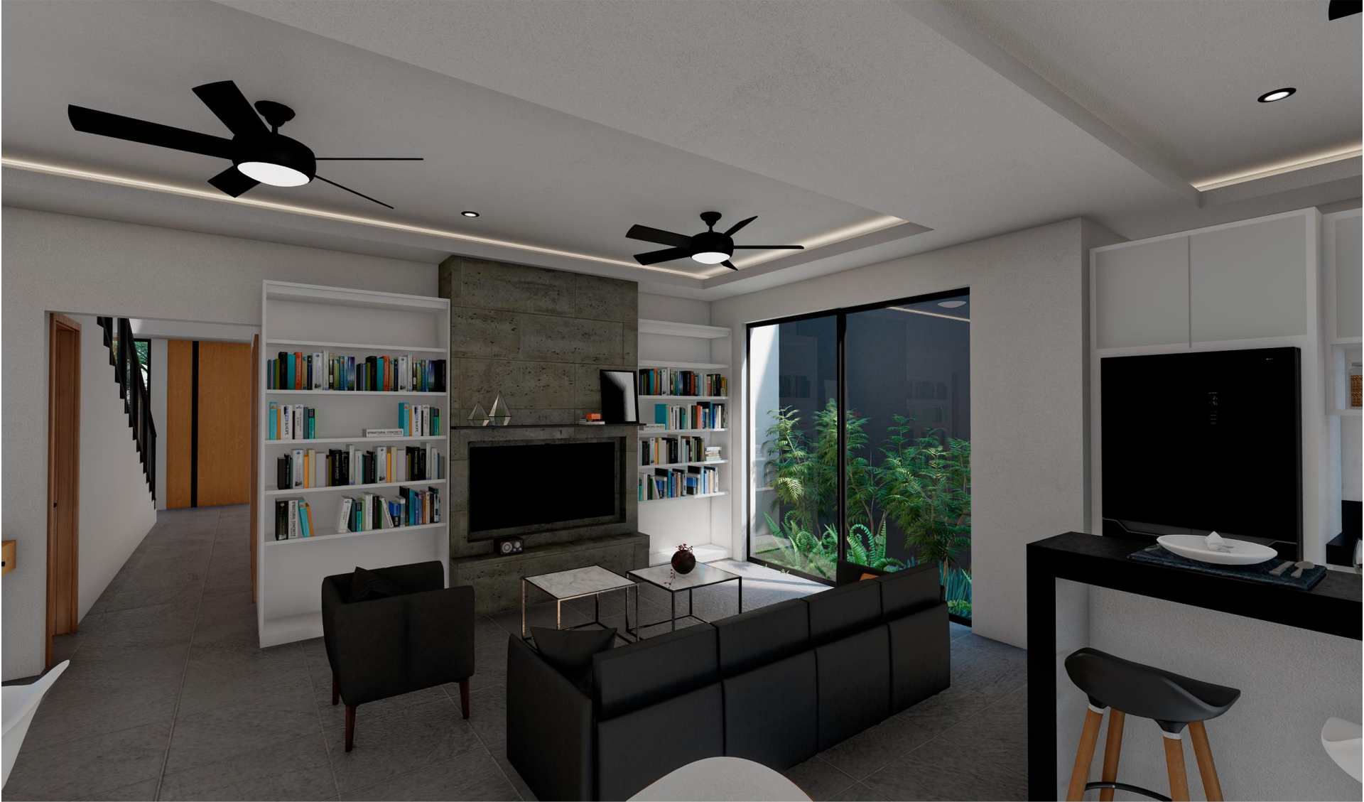
LIVING ROOM / SALA DE ESTAR