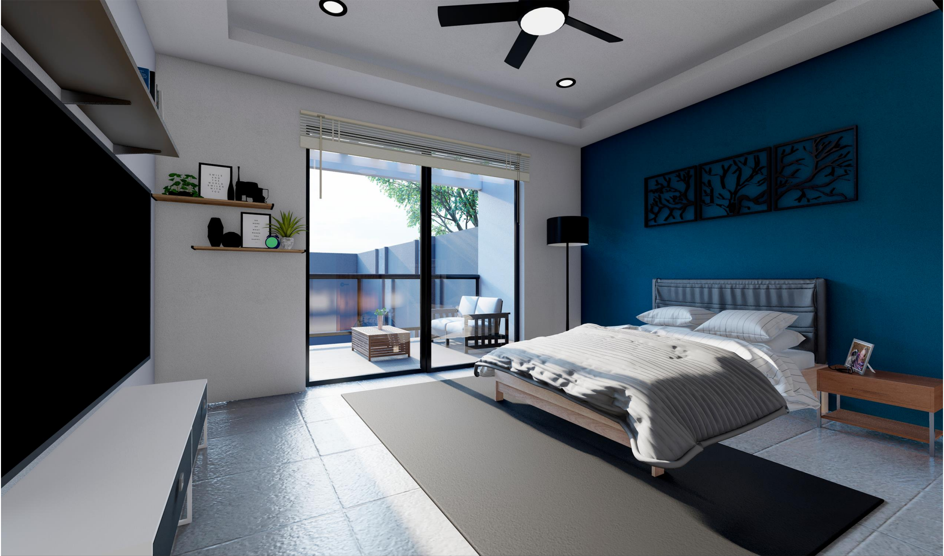
GUEST BEDROM / RECAMARA HUESPEDES