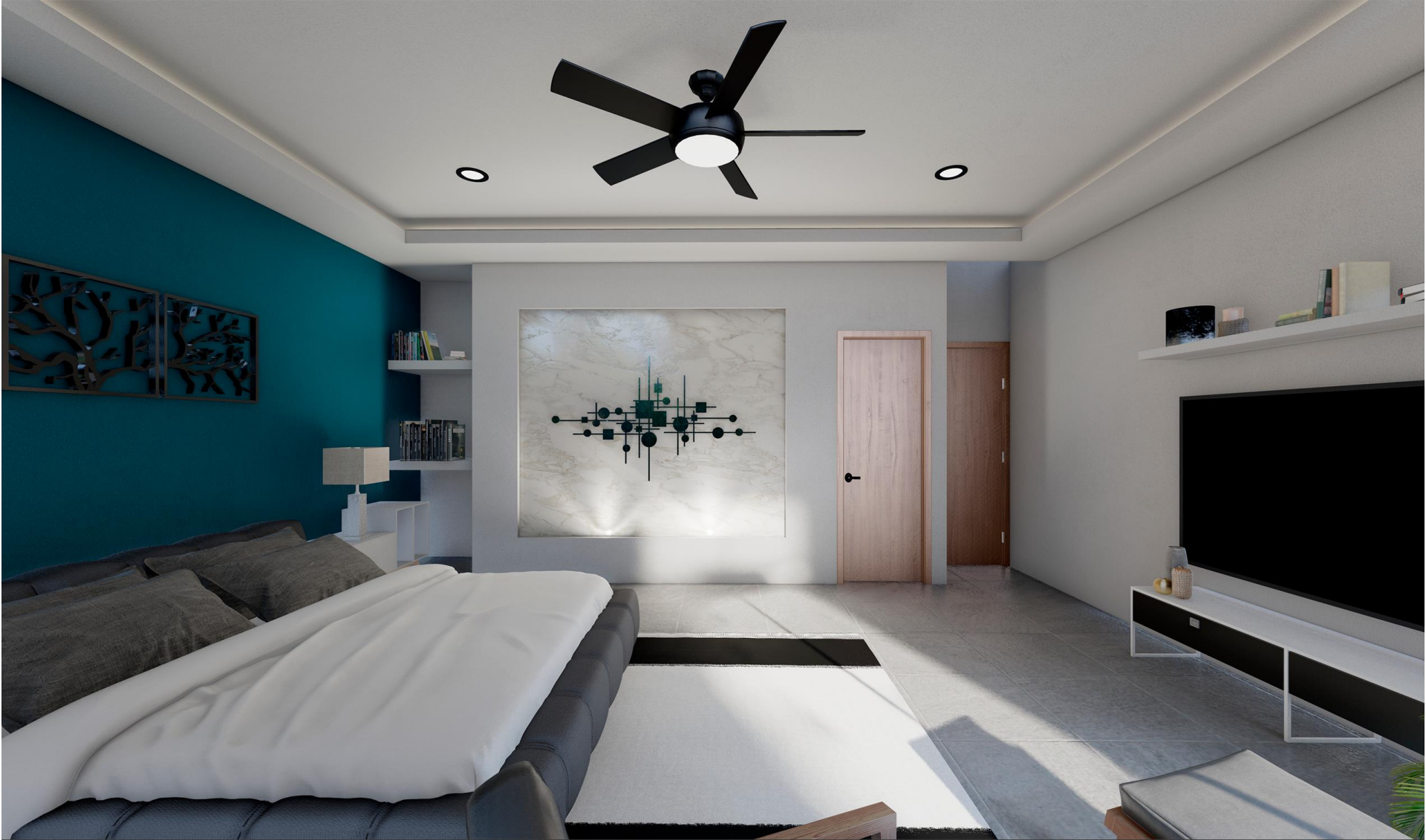
MASTER BEDROOM / RECAMARA PRINCIPAL